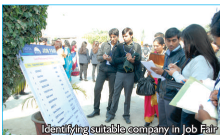
Identifying suitable company in Job Fair

reflected in their placements. The placement ratio at SCT is 1:3 i.e. each student has minimum 3 offers from different companies. Companies are still approaching college for the recruitment drives but the college has to refuse the offers for the current batch. Some of the companies who have hired SCT students are HDFC, Varun Beverages, Industry Buying, Convergys, Velocity, Production Aids, Info Edge, Budget.com, Make My Trip, Unicommerce, Genpact, Ameriprise & many more.