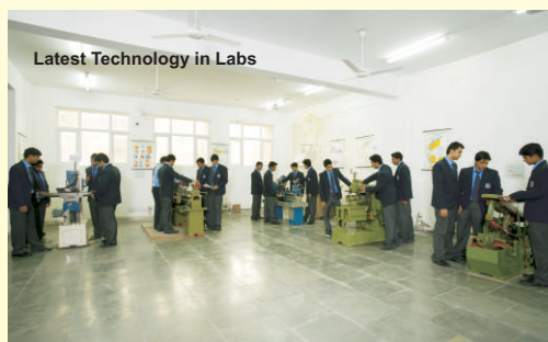
Latest Technology in Labs