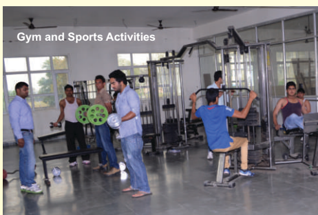
Gym and Sports Activities