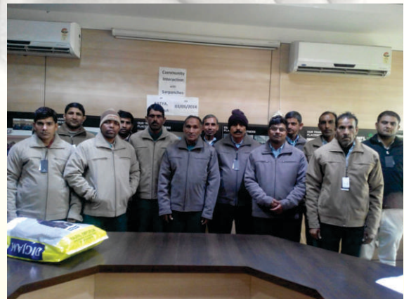
Distributing Woollen clothes to underprivileged people on New Year