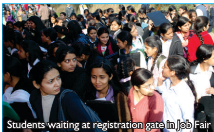
Students waiting at registration gate in Job Fair