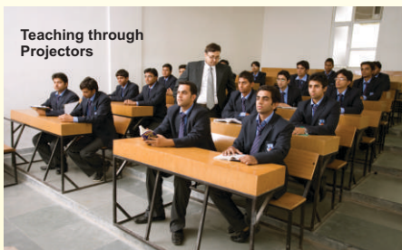
Teaching through Projectors