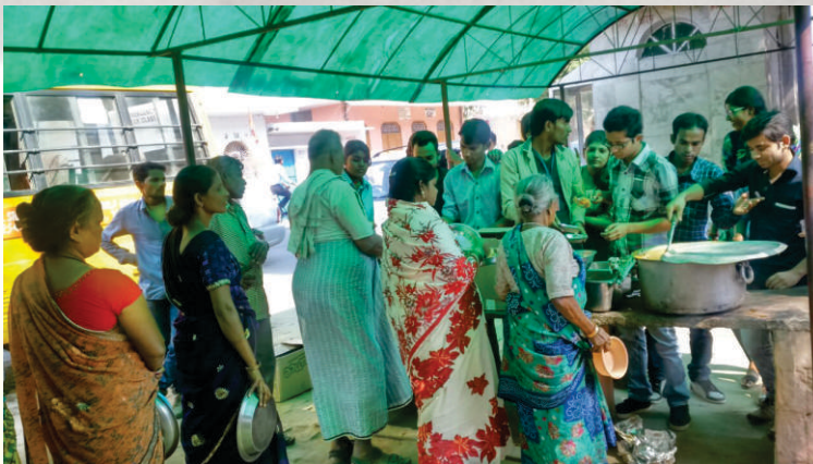
Students and Faculty members distributing sweets/meals at Leprosy home on Diwali

These activities are inculcating human values in their life, sense of belongingness, team bonding and making them not only good Engineers or Professionals but also a GOOD HUMAN BEING. The journey of SFT will continue with more and more such activities....”