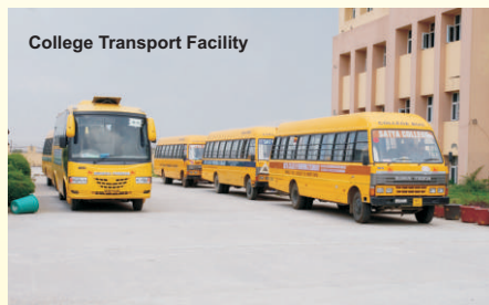
College Transport Facility