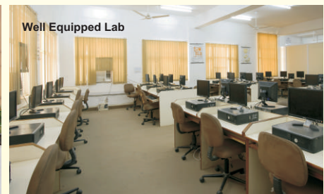
Well Equipped Lab